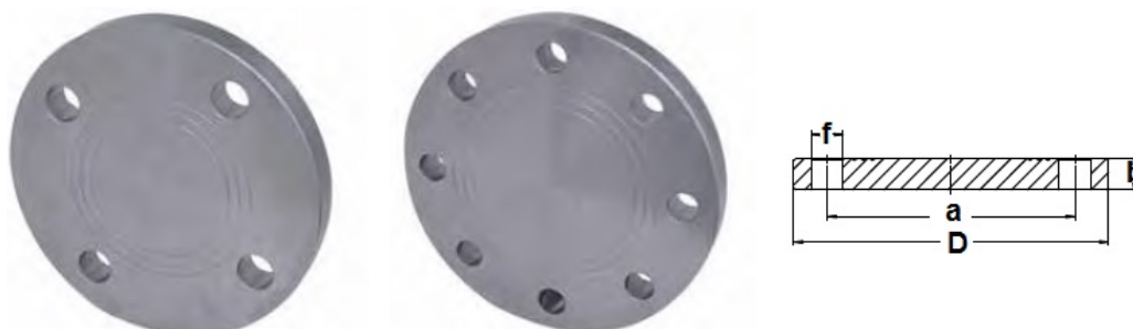
FLANGE CIECHE UNI EN 1092-1 PN 10 - 16 EX UNI 6092 - 6093