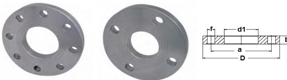
FLANGE PIANE UNI EN 1092-1 PN 25 - 40 EX UNI 6083 - 6084