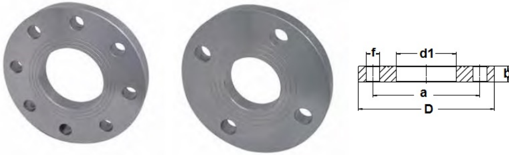
FLANGE PIANE UNI EN 1092-1 PN6 EX UNI 2276