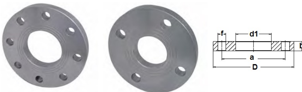
FLANGE PIANE UNI EN 1092-1 PN 10 - 16 EX UNI 2211-2218