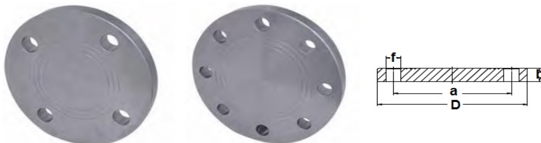
FLANGE CIECHE UNI EN 1092-1 PN 25 - 40 EX UNI 6094 - 6095