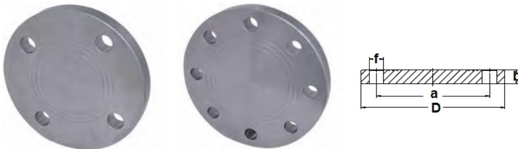
FLANGE CIECHE UNI EN 1092-1 PN 6 EX UNI 6091