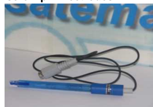
Cable pH Electrode