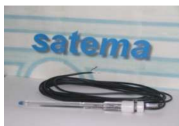
PH electrodes with electrolyte reserve