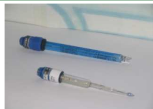
screw pH Electrodes